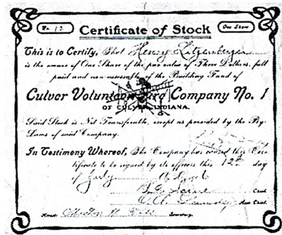
Beginning in May 1905 every fireman was required to buy one stock certificate at three dollars per share. These funds were used to cover the cost of a permanent meeting place for "The Company."

Sept. 1 - The Catholic Church was struck by lightning and burned. Nothing could be done. Out to protect other buildings nearby.